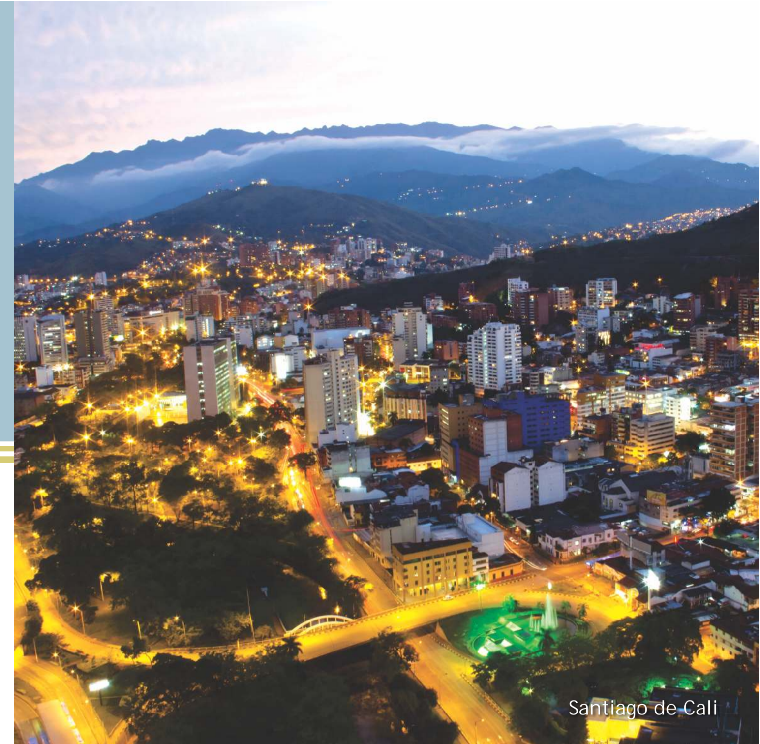
Santiago de Cali

Objective: To advance political dialogue and international cooperation for the economic development of Africa and its Diaspora.